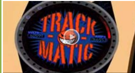
Funny Money Track-O-Matic