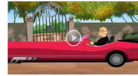
Funny Money Building Long-term Wealth